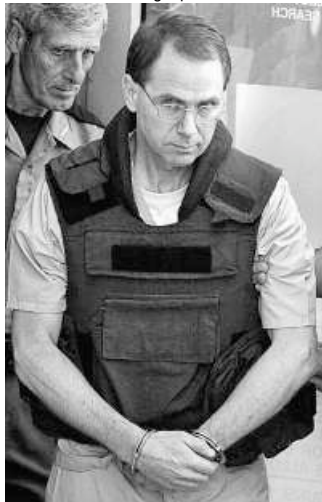
Terry Nichols is serving life prison sentences related to the Oklahoma City bombing.

WASHINGTON - Pursuing a tip that they missed evidence a decade ago, FBI agents searched the former home of convicted Oklahoma City bombing conspirator Terry Nichols and found blasting caps and other explosive materials apparently related to the 1995 attack, officials said Friday.